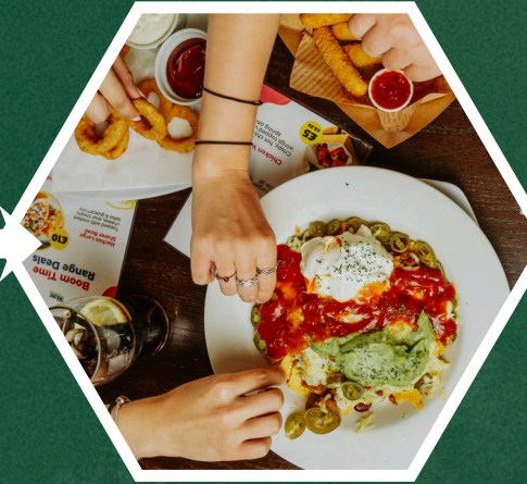
3. Food Served (During Play)