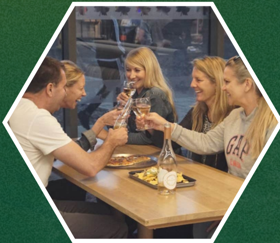
Private Event Space