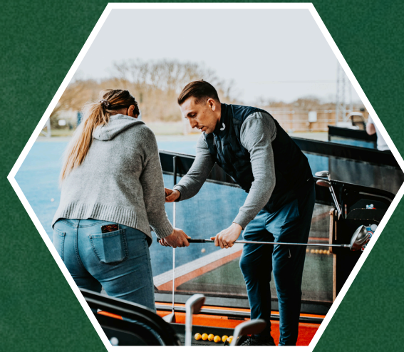
Group Golf Lesson