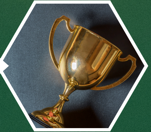
4. Prize Presentation (30 Minutes)