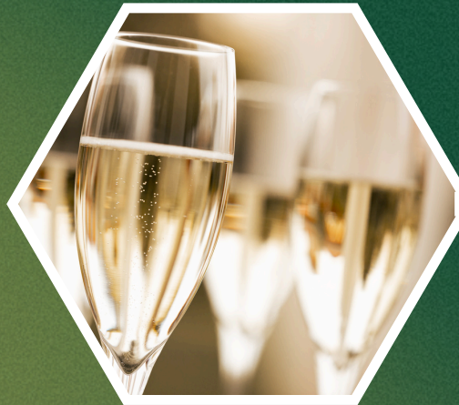
1. Arrival Drinks (15 Minutes)

Our event hosts run the competition so you can relax and enjoy the event.