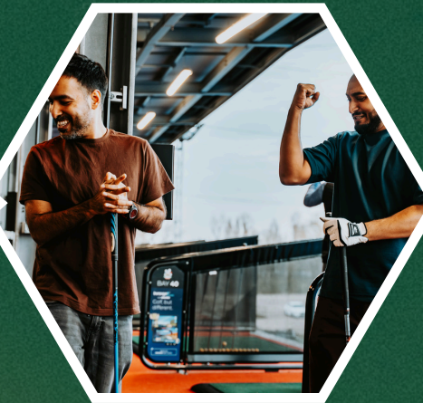
2. Team Competition (2 Hours)